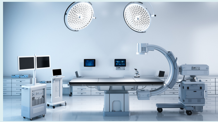
Medical Imaging System