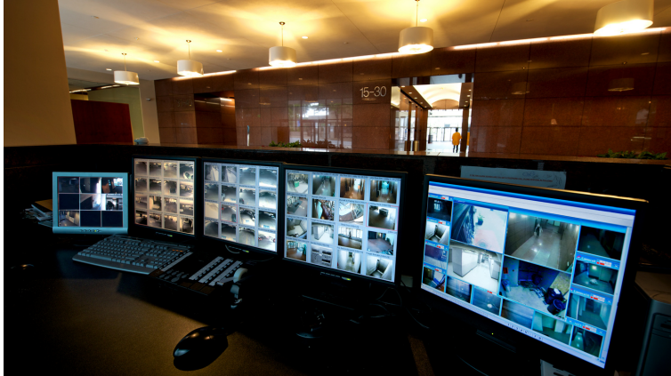
Security Monitoring System