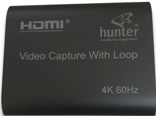
Hunter HDMI Video Capture Card