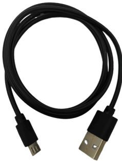
USB A to Male Micro USB B Cable