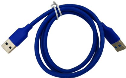
USB A to USB A Cable