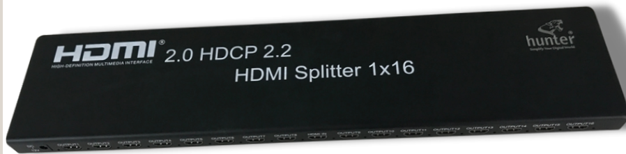
Hunter HDMI 2.0 1x16 Splitter