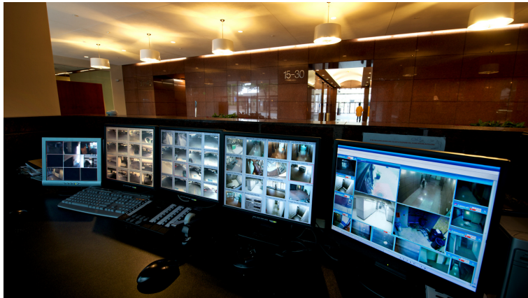
Security Monitoring System